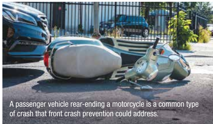
A passenger vehicle rear-ending a motorcycle is a common type of crash that front crash prevention could address.

For motorcycles specifically, developing and equipping them with front crash prevention, lane maintenance and other technologies also would reduce crashes. In rear-end crashes of all severities, the motorcycle was more likely to strike the passenger vehicle than the passenger vehicle was to hit the motorcycle, Teoh found. Among crashes involving two vehicles initially traveling in opposite